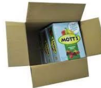
14483000 6-8ct sleeves