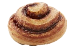
105358000 FTO 3oz Cinnamon Roll