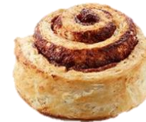
106226000 FTO 5oz Cinnamon Twirl