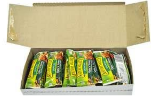
11582000 (144 ct .74oz bars)