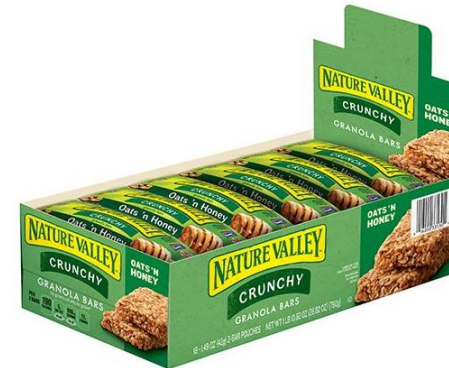
3353000 (6-18ct sleeves)